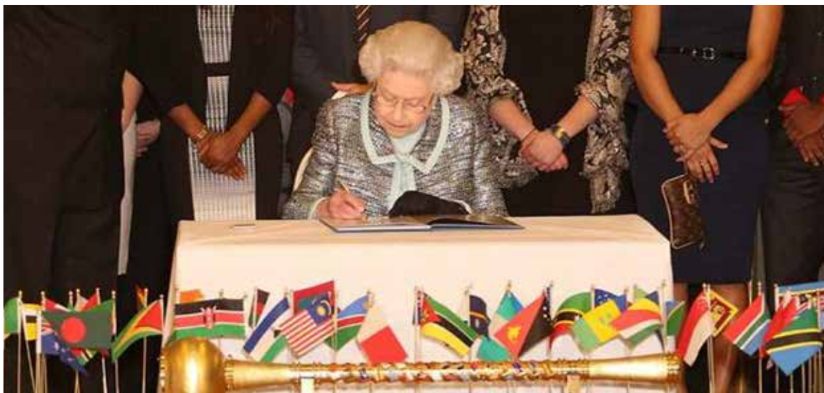
Her Majesty Queen Elizabeth II signing the Commonwealth Charter at Marlborough House, London on Commonwealth Day, 11 March 2013

The Commonwealth Charter ('the Charter') was formally adopted in 2013. It is a consolidating and unifying document that sets out the institution's values and aspirations. It was conceived as a means of updating and melding the previous declarations that had come to define the institution's norms and parameters. It is a high-level document and does not provide the granularity of previous Commonwealth statements – for example, on the separation of powers, the elimination of discrimination, economic justice, or democracy and human rights.